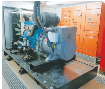
Mossel River sewerage pump station in Hermanus.

Over the past couple of months, Bulletin kept readers abreast of the progress made with the installation and commissioning of emergency generators at nine of Overstrand Municipality's water reticulation and waste-water treatment plants.