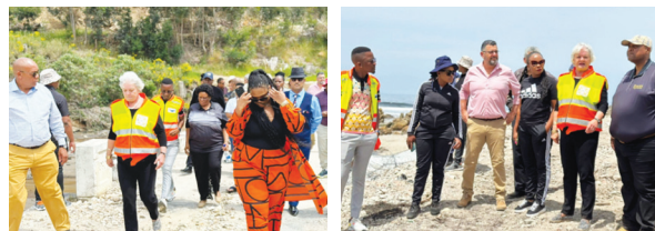
"To underscore the storm's devastating impact, the SALGA group also paid a brief visit to Onrus Beach and were afforded a glimpse of the damage caused to the Hemel-en-Aarde Pass."

He also provided feedback on the progress made to date to restore crucial infrastructure.