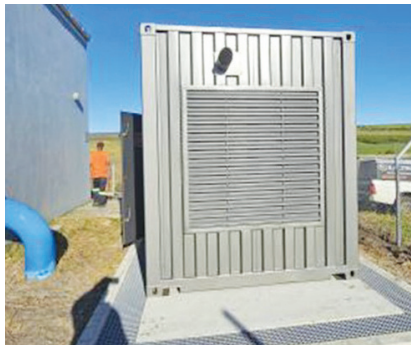
Kraaibosch Dam Raw Water PS, Gansbaai